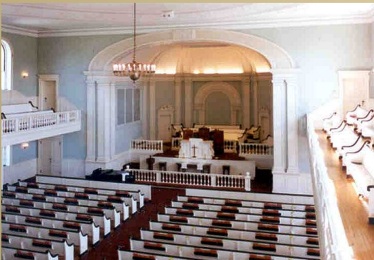
BEFORE RENOVATION / RESTORATION

This project involved renovation & restoration of the interior of this elegant church designed in the 1920's by the noted architect, James Gamble Rogers. The chancel was rebuilt to correct structural problems in the chancel floor. Renovation done to the chancel provides a larger, more flexible space. With even the large pulpit being movable, the entire chancel area is now more flexible, able to accommodate a variety of services and special events, including concerts with large choirs and musical ensembles.