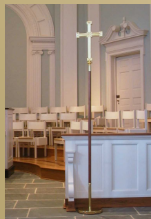
NEW CROSS IN 23 K GOLD LEAF