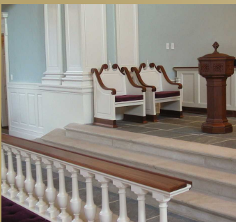
NEW MOVABLE COMMUNION RAILS & CLERGY CHAIRS

Carpet was removed from the chancel to improve acoustics and the reconfigured chancel platform is finished with Pennsylvania Bluestone with Indiana Limestone steps. The new choir platform is quarter sawn white oak with walnut inlay accenting the treads.