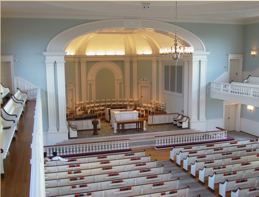
AFTER RENOVATION / RESTORATION