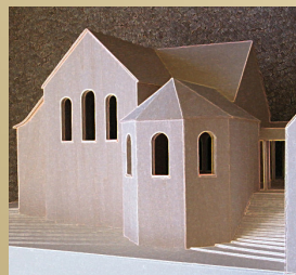
Model Showing possibility for Future Expansion