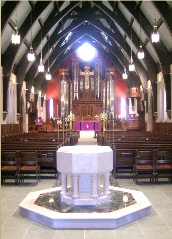
Chancel From Font