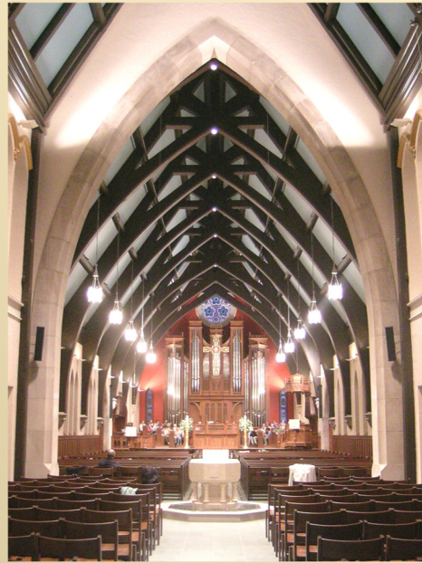
View of Nave & Chancel from Entry