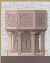
Early Font Design