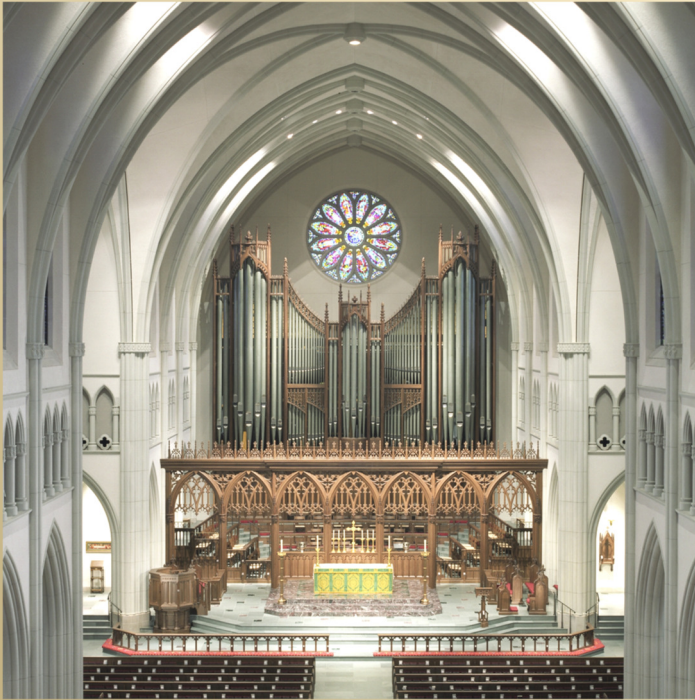
Chancel From Balcony