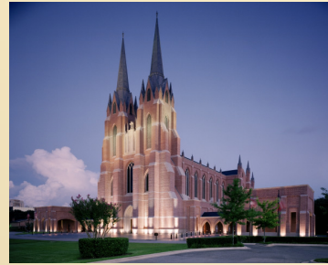
Exterior at Dusk