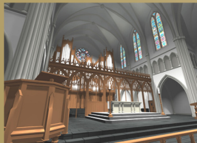
Early Computer Renderings