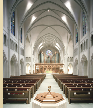
View of Nave & Chancel from Entry