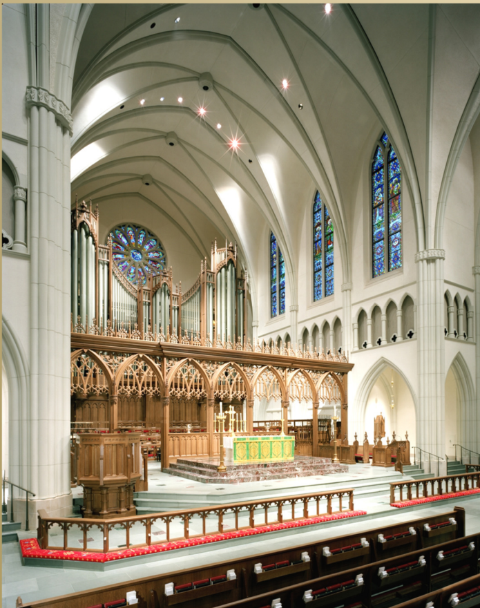
Chancel with Choir Screen & Organ