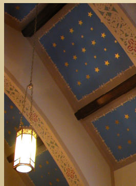
DECORATIVE PAINTING SCHEME