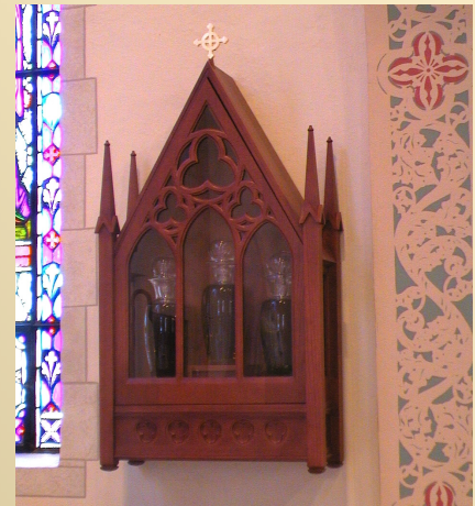
NEW HOLY OILS AMBRY