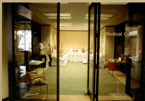
Interior - Before