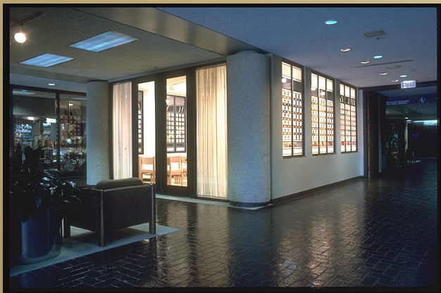
New Chapel - Exterior

This non-denominational chapel is located in the lobby of a large hospital and was previously a gift shop with an aluminum storefront, 2x4 acoustical ceiling tiles, and fluorescent lighting. The chapel seats 24 with the lobby serving as overflow when the glass doors are open for larger services.