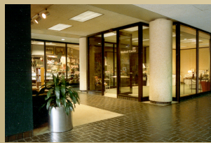
Exterior - Before