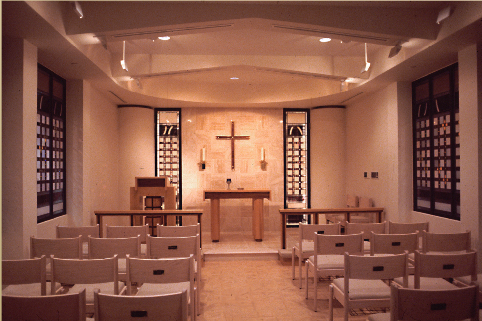
New Chapel - Interior