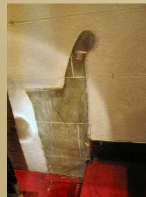
Original Faux Finish Behind Pew End