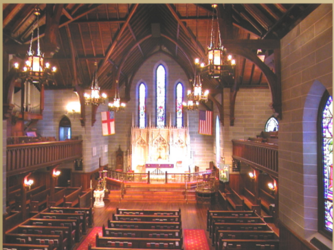
View of Nave & Chancel from Balcony