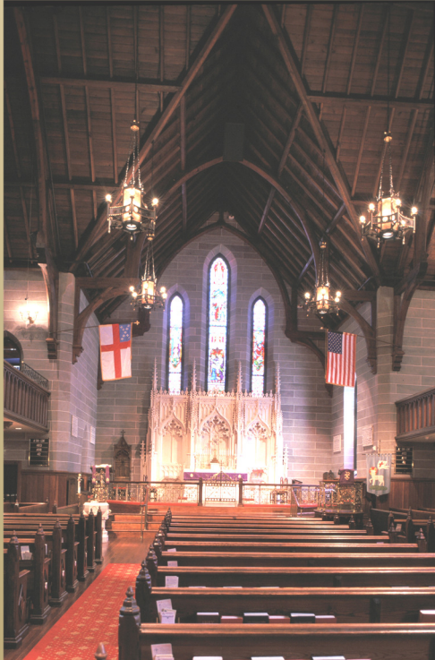
Chancel & Reredos

LITURGICAL DESIGN CONSULTATION MASTER PLANNING