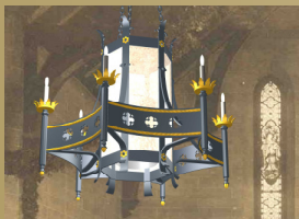
New Light Fixture