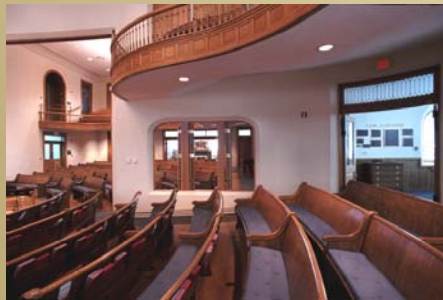
NEW SHUTTERED WINDOW OPENING BETWEEN LARGE & SMALL WORSHIP SPACES