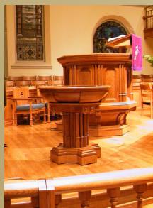
NEW FONT AND PULPIT