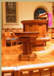
NEW FONT AND PULPIT

The project also involved installation of a new pipe organ, new lighting, and design of new movable chancel furnishings in quarter sawn white oak in the style of the original furnishings lost in a previous renovation.