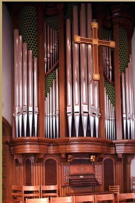
NEW CROSS & PIPE ORGAN

Several new doorway and window openings have been added between these various areas to provide continuity from space to space as well as allowing more natural light into the assembly area. A single step which was a tripping hazard between the two main rooms was eliminated by lowering the floor structure in the smaller worship space to match the sloped floor of the main church..