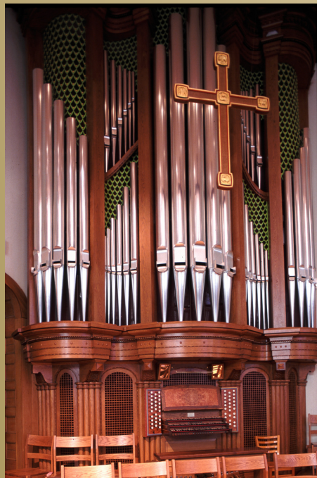
NEW CROSS & PIPE ORGAN