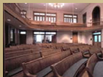
NEW DOORS TO PARLOR & HISTORY ROOM