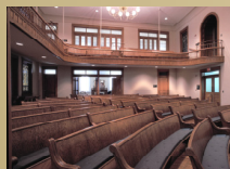
NEW DOORS TO PARLOR & HISTORY ROOM