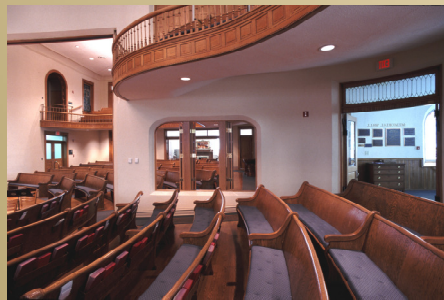
NEW SHUTTERED WINDOW OPENING BETWEEN LARGE & SMALL WORSHIP SPACES