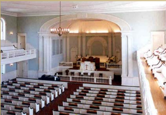
BEFORE RENOVATION / RESTORATION

Carpet was removed from the chancel to improve acoustics and the reconfigured chancel platform is finished with Pennsylvania Bluestone with Indiana Limestone steps. The new choir platform is quarter sawn white oak with walnut inlay accenting the treads.