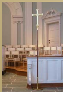
NEW CROSS IN 23 K GOLD LEAF