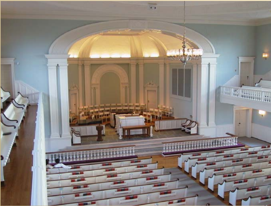
AFTER RENOVATION / RESTORATION

LITURGICAL DESIGN CONSULTATION MASTER PLANNING