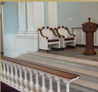
NEW MOVABLE COMMUNION RAILS & CLERGY CHAIRS