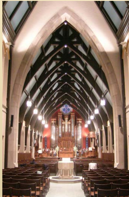
View of Nave & Chancel from Entry