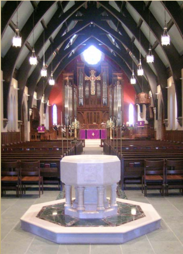
Chancel From Font

LITURGICAL DESIGN CONSULTATION MASTER PLANNING