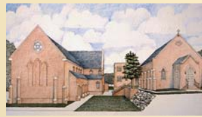
DESIGN DEVELOPMENT DRAWING

LITURGICAL DESIGN CONSULTATION MASTER PLANNING