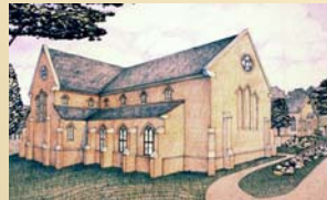
DESIGN DEVELOPMENT DRAWING