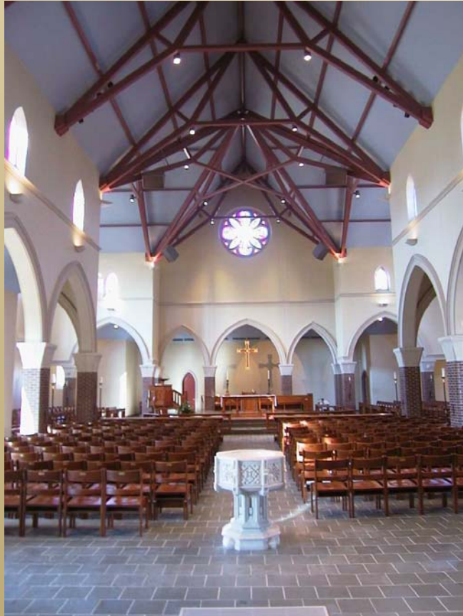
NEW NAVE LOOKING TO THE EAST