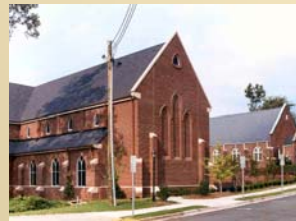
EXTERIOR WITH OLD CHURCH IN BACKGROUND