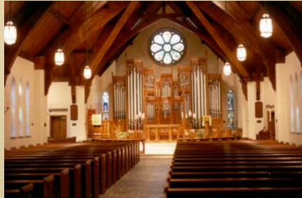
AFTER ADDITION & RENOVATION