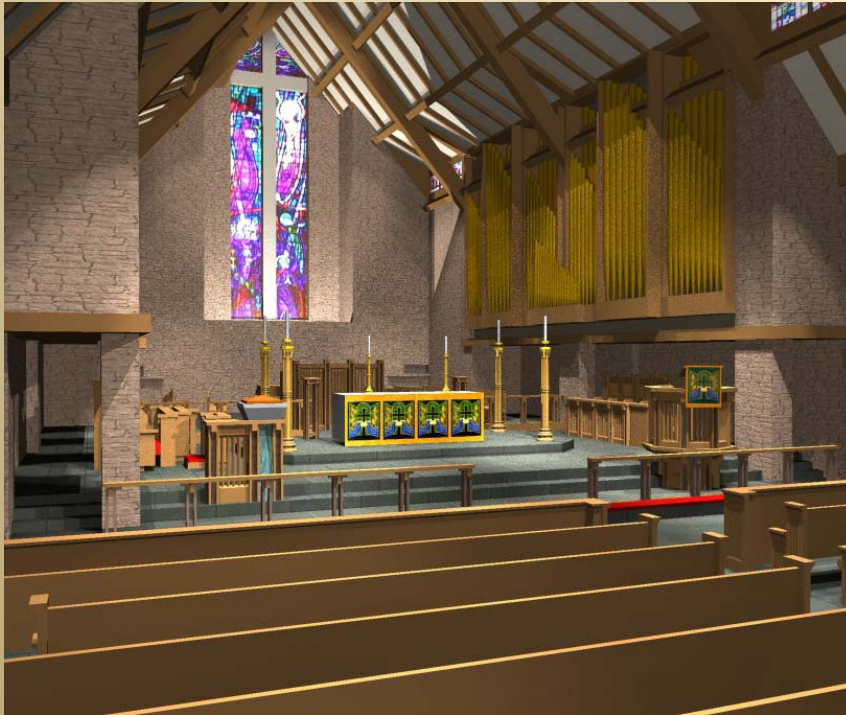
View from Nave

LITURGICAL DESIGN CONSULTATION MASTER PLANNING