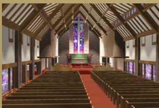
Model of Existing Conditions