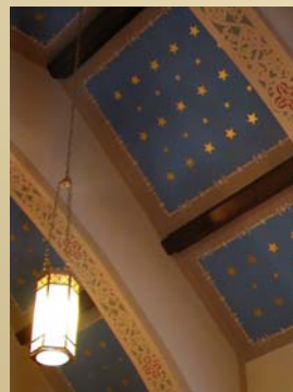
DECORATIVE PAINTING SCHEME