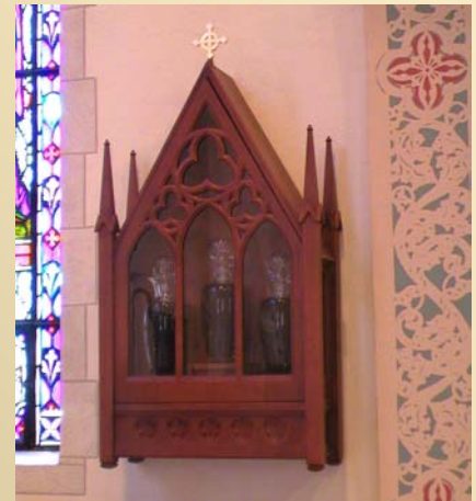
NEW HOLY OILS AMBRY