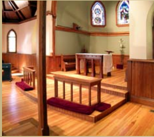
Altar table & communion rail