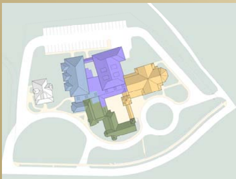
Phased Master Plan