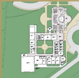
Phase I & Phase II