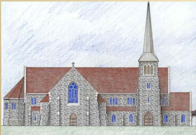
North Elevation with Stone Façade Option

LITURGICAL DESIGN CONSULTATION MASTER PLANNING