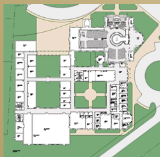
Phase III & Phase IV