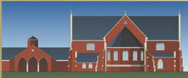
East Elevation with Brick Façade Option