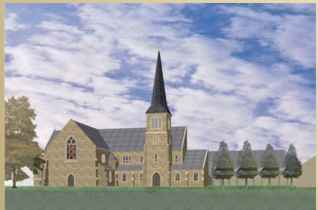
Perspective View at Tower Entry

Eason & Farlow Design, PA produced all the presentation materials in-house including 3-D computer animations & modeling. While traditional in form, this church space has a gathered seating arrangement, a flexible choir with space for a future pipe organ, and courtyards and gathering spaces near the future nave entrance.