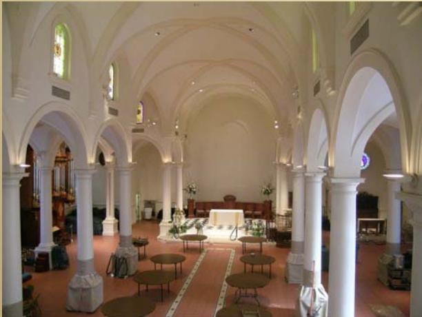
Nave set up to serve meals