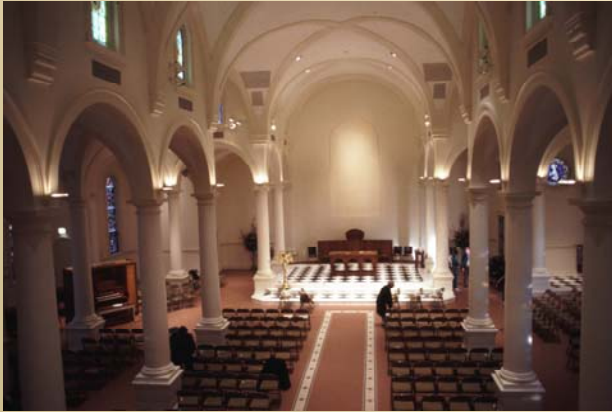
Nave set up for worship

LITURGICAL DESIGN CONSULTATION MASTER PLANNING