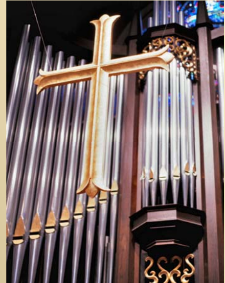
New Hanging Cross