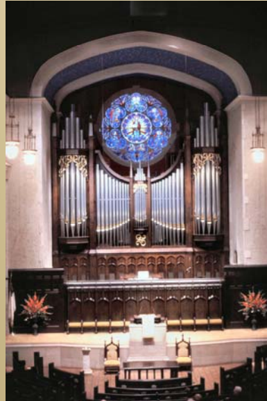
After Phase 1