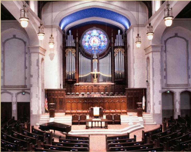
After Phase 2