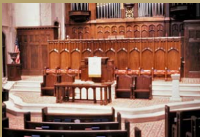
Communion Table, Pulpit, & Clergy Stalls