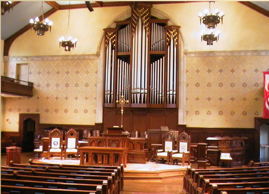
Chancel & Choir

LITURGICAL DESIGN CONSULTATION MASTER PLANNING