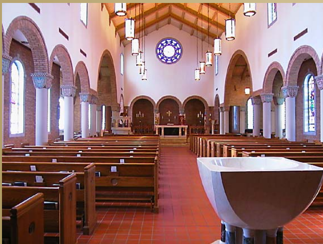
View from Entry w/ Font

Inlaid marble floor in a labyrinth pattern highlights the new altar location and defines sense of scale. New altar retains green marble original altar as central pylon; new Botticino mensa is supported by 8 Siena columns on limestone base. Limestone pulpit (Ambo) and Botticino baptismal font, suitable for infant immersion, feature multi-species marble columns. New cross of oil and water gilt and set with carnelians and lapis recalls the labyrinth pattern.